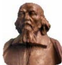
The bust of John Amos Comenius on Faculty of Education in Prague